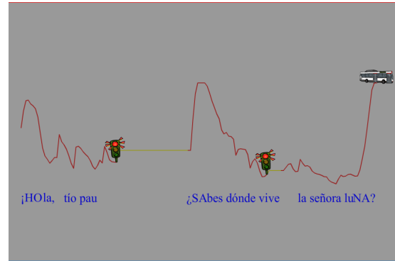
Figure 3: Prosodic activity. The user has to reproduce the intonation contour and to make the breaks at the traffic lights.

The activities are included in the general context of the game and players need to do them in order to progress in the game. All the activities have been planned according to the principles of learning that have proven most effective for teaching and presenting information to people with intellectual disabilities [3, 4].