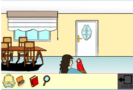
Figure 2: Main game screen, in which the player's avatar (the girl) and the virtual assistant (the parrot) are visible.

The development of the scenarios, items and characters has a uniform design, close to cartoons, but without making them too childish. Bright colors are used in accordance with the scenarios represented in the game. A simple text font is used, with a larger size than usual to make it easier to read.